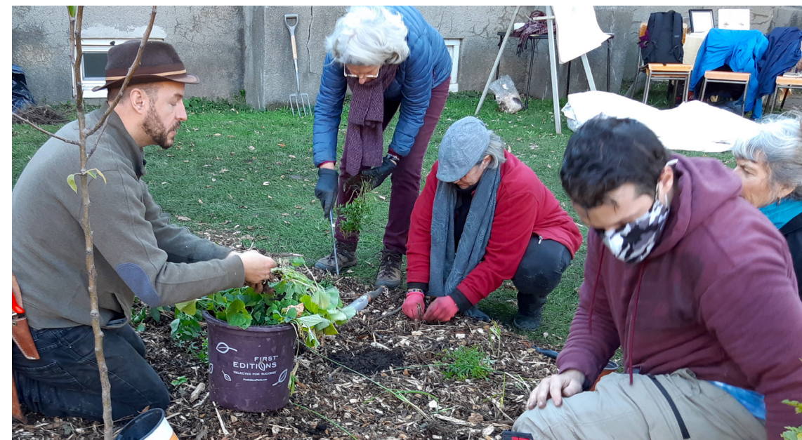
Planting the pocket forest undergrowth. Photo supplied.

Twenty or so people signed up for the workshop, although