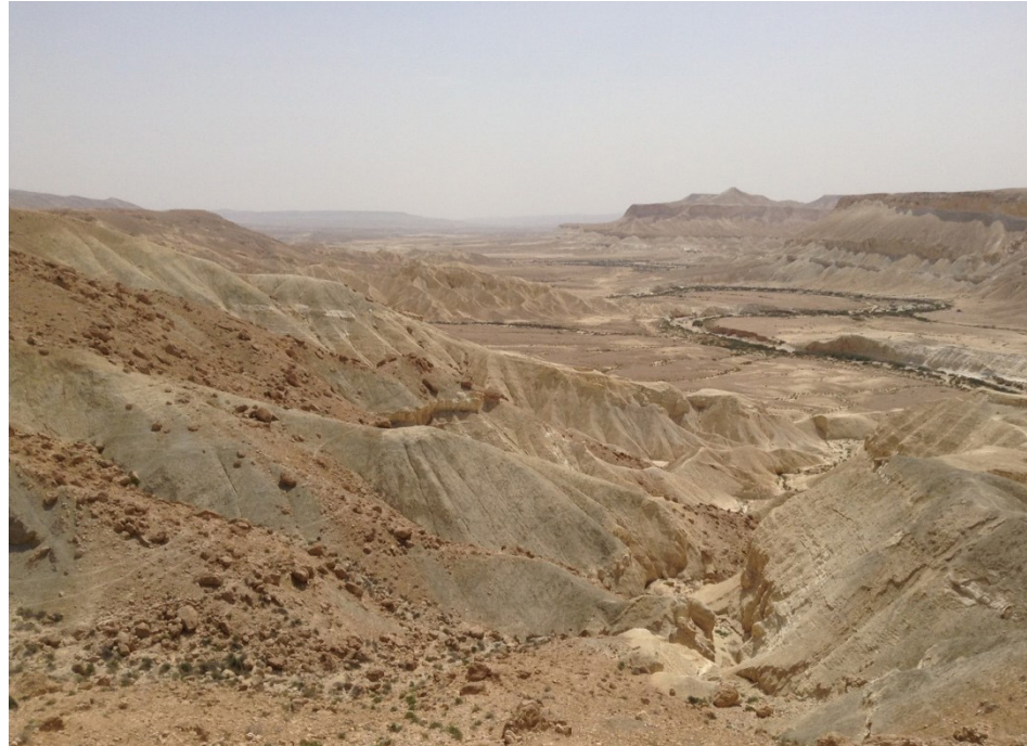
The wilderness of Tsin canyon/Le désert du canyon de Tsin.

Le Carême commence le 2 mars, mercredi des Cendres, et comme beaucoup d'entre vous, j'ai l'impression d'observer le Carême depuis deux ans !