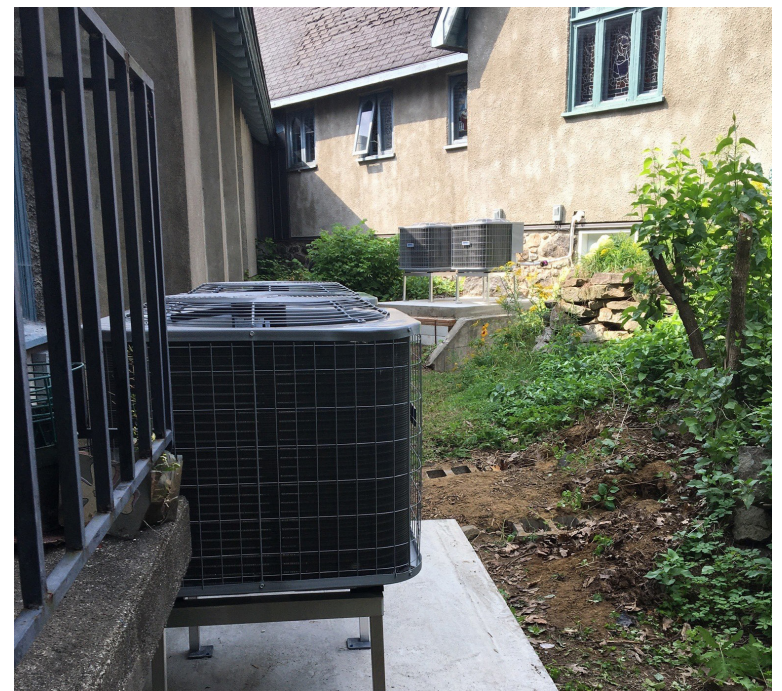
Outside portions of the air-source heat pumps used at Trinity Church, Ste-Agathe. A heat exchanger inside the basement furnace heats the church's forced-air system.