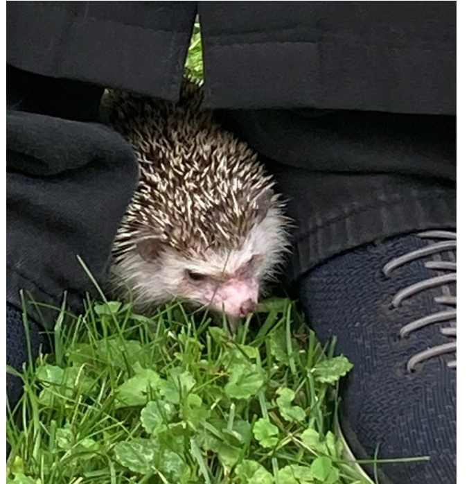
Fifi the hedgehog.