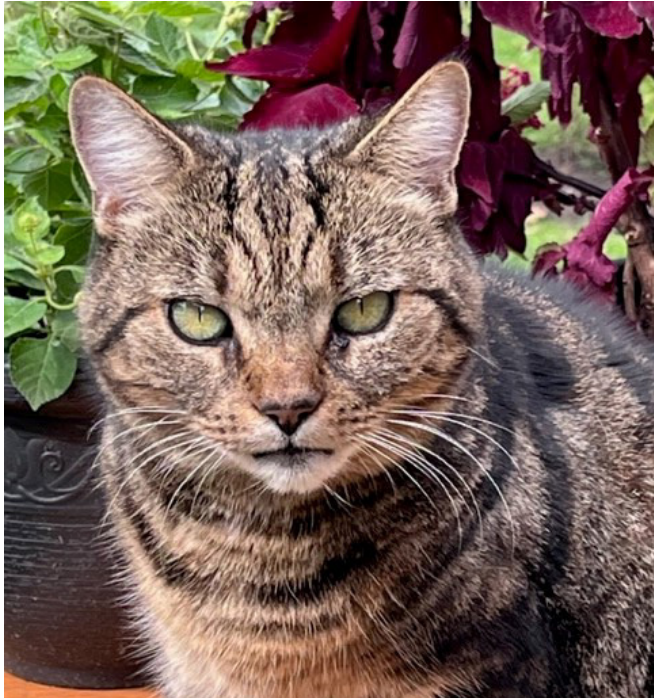
Hello, kitty.