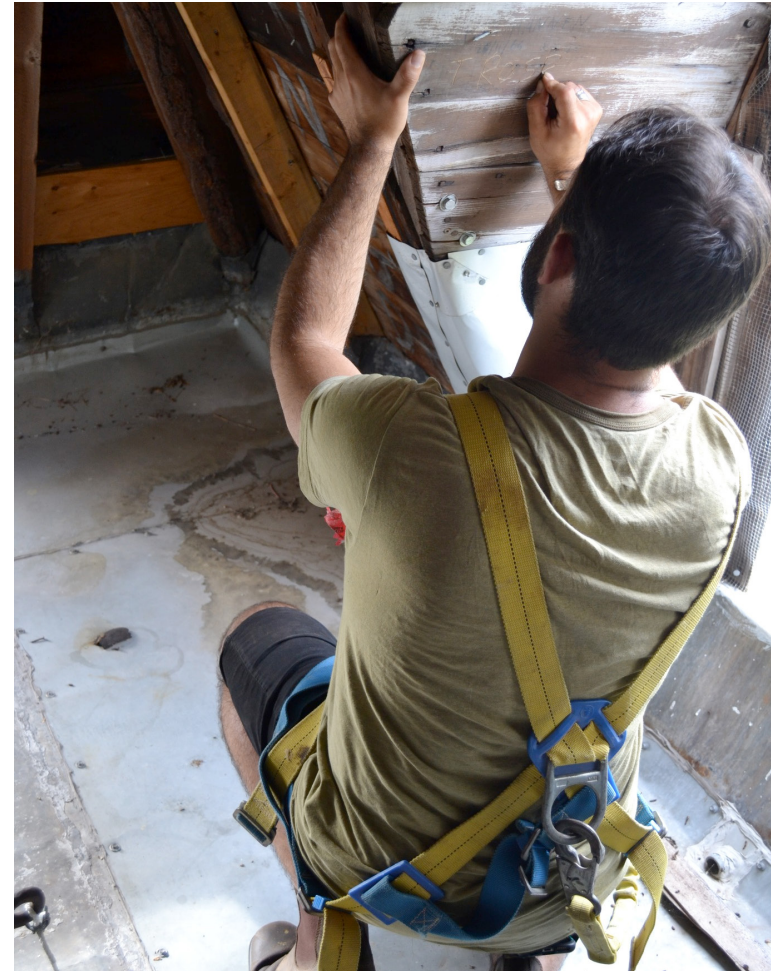
"I found a nail and carved my own name underneath his."

Much has changed in the life of our rural churches since the 1960's. Yet, much remains the same. We continue to gather in faithful discipleship and prayer, growing together, in communion with that "great a cloud of witnesses" who have gone before us (Hebrews 12:1)!