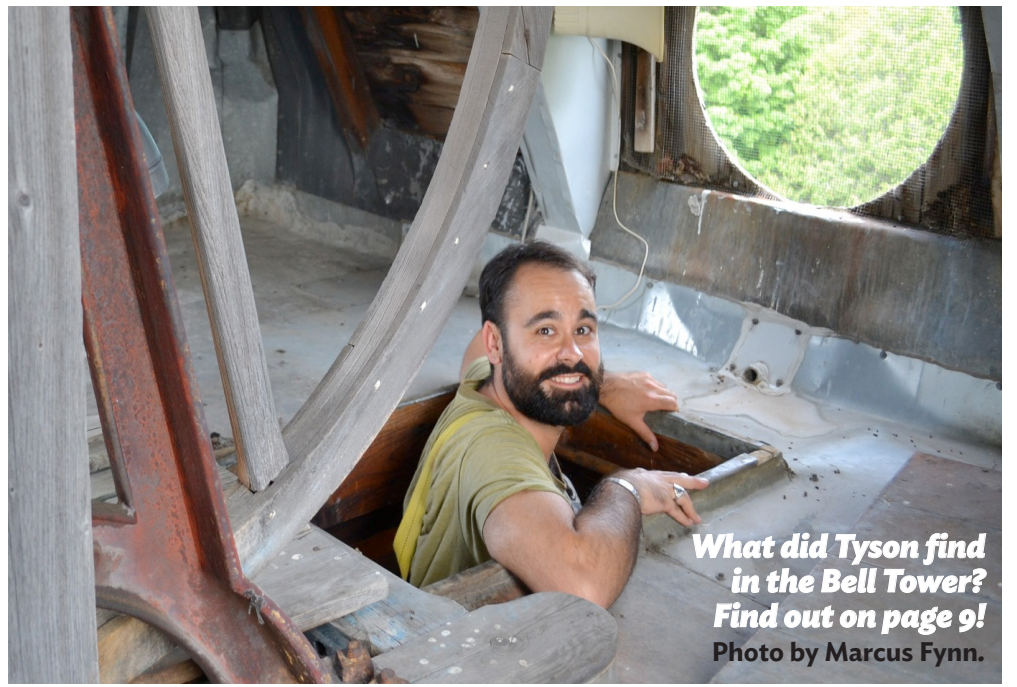
What did Tyson find in the Bell Tower? Find out on page 9!

Winter 2022 • A section of the Anglican Journal