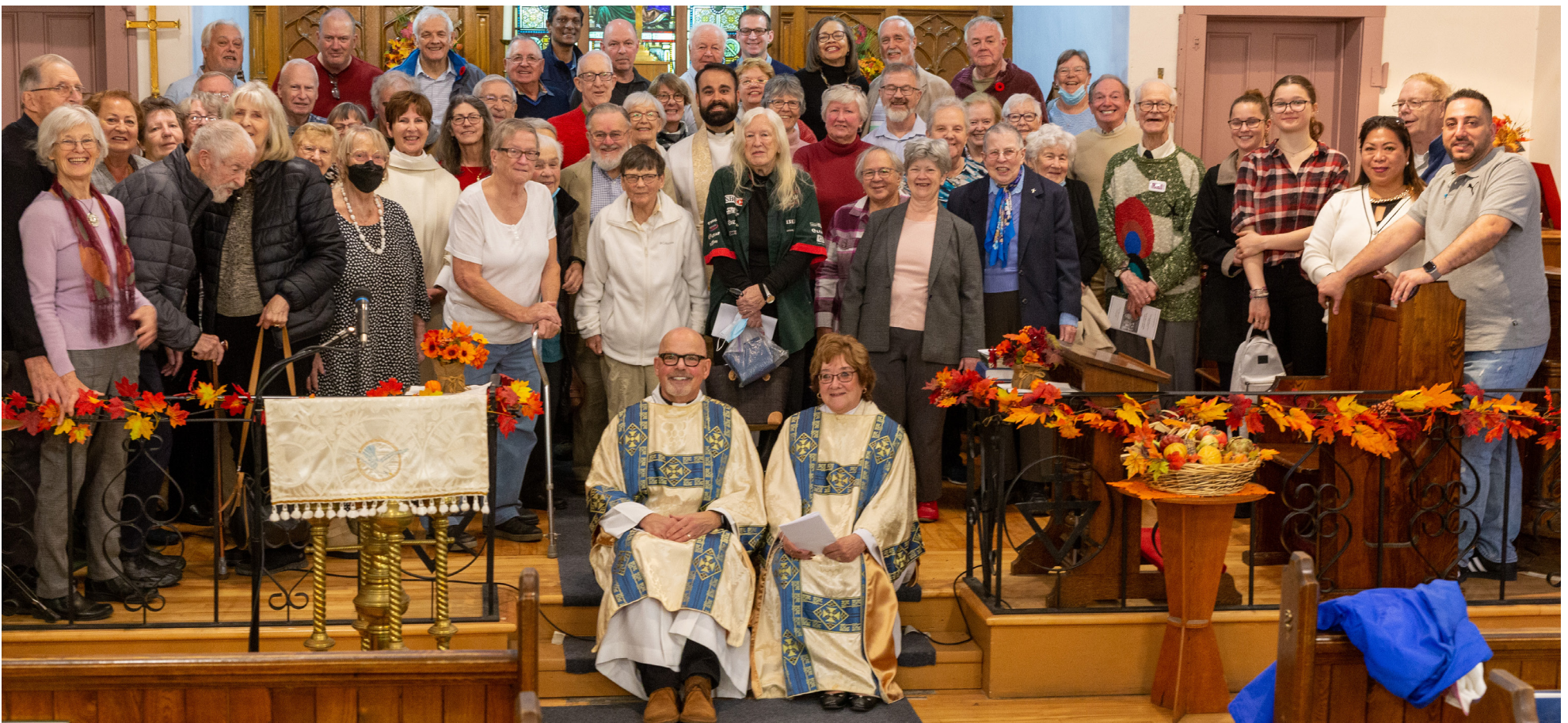
"A gathering of All the Saints from the Regional Ministry of the Eastern Townships on Sunday, October 30th, at Trinity Church in Cowansville. After Eucharist, we all enjoyed a pot-luck meal together in the parish hall. The more we get together, the happier we'll be!"